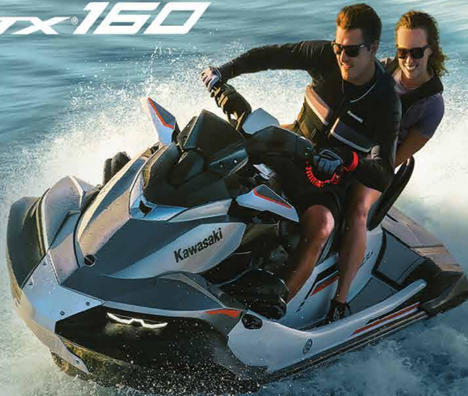
JET SKI® STX® 160