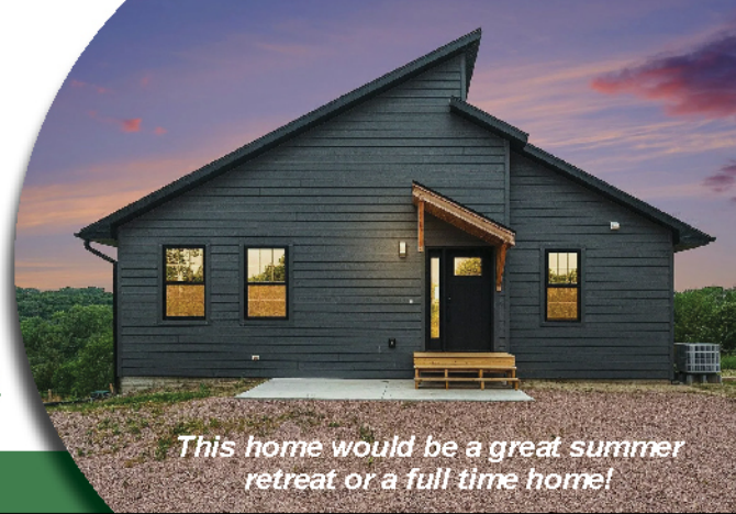
This home would be a great summer retreat or a full-time home!

PRICE IMPROVEMENT - NOW PRICED TO MOVE DON'T MISS YOUR CHANCE AT THIS PROPERTY!